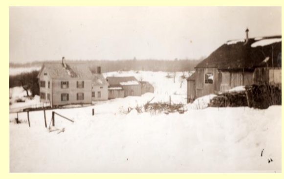
Pillwillop Farm in 1936

Most workers on the farm are volunteers, upgrades to the land and buildings rely for the most part on volunteer labor and donated products.