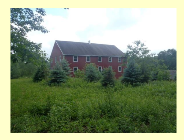
The Farm is part of Community Counseling which is an independent 501 c 3 not for profit. Any donations to the program are tax deductible.

Counseling Services : Services include: Individual, couples, family and group therapy for children, adolescents and adults. Therapy takes place in the office, in the fields or in the wooded areas based on client preference and clinical appropriateness.